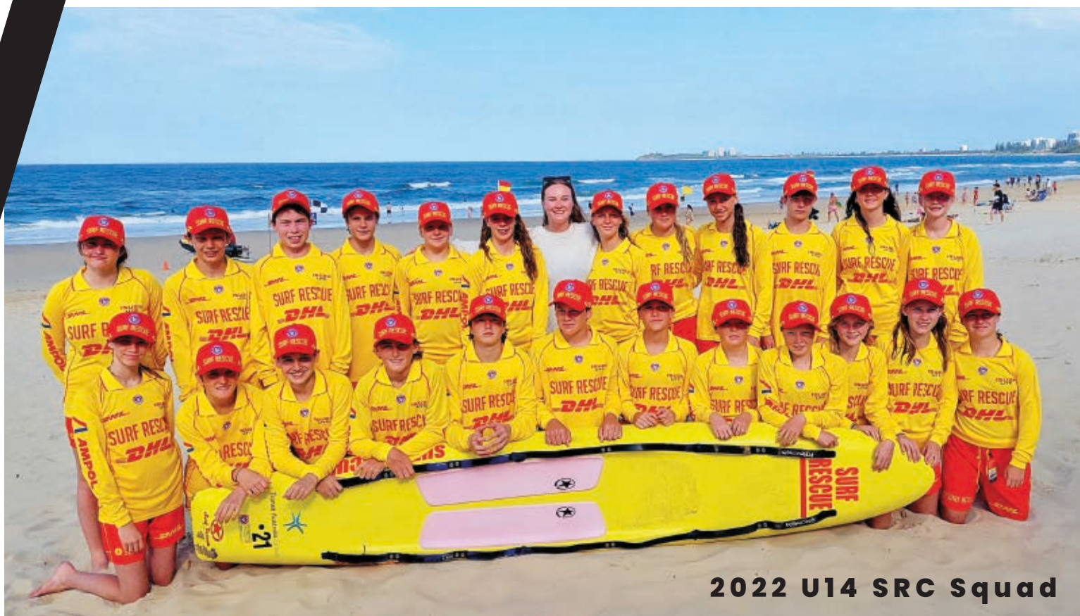
2022 U14 SRC Squad