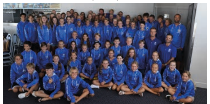
STATE UNIFORM PRESENTATION